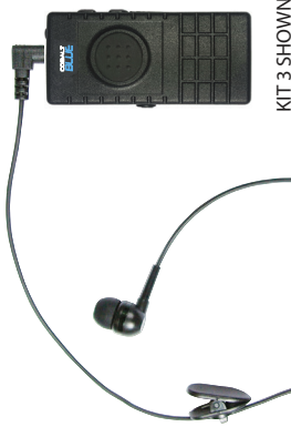
COBALT AV BLUE-MIC2-KU Made in Taiwan

For use with Android and Apple iOS smartphones using the AT&T EPTT app.