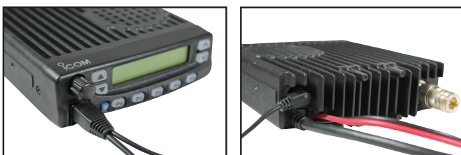
FIG. 3 Typical Front and Rear Connection Radio