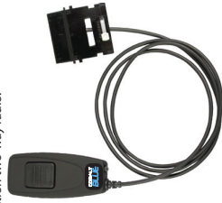
Bluetooth Adapter Model No.: BLUE-MOB Made in Taiwan

The BLUE-MOB Mobile Adapter allows you to use a compatible wireless headset or other audio accessory with your mobile or base station two-way radio.