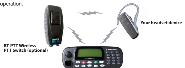
FIG. 4 - Wireless Communication System