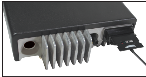
FIG. 2 Typical Rear Connection Type Radio