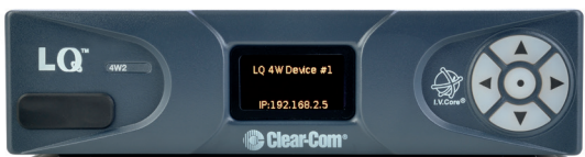
LQ-4W2 Front Panel