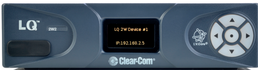
LQ-2W2 Front Panel