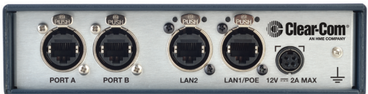
LQ-4W2 Rear Panel