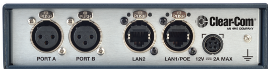
LQ-2W2 Rear Panel