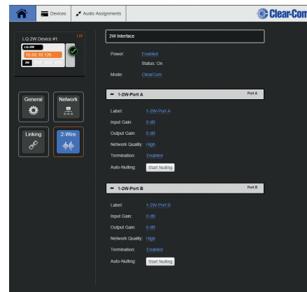
Port Configuration Screen